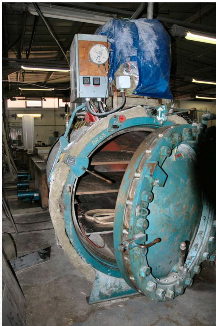
Figure 2: View of Autoclave Door etc