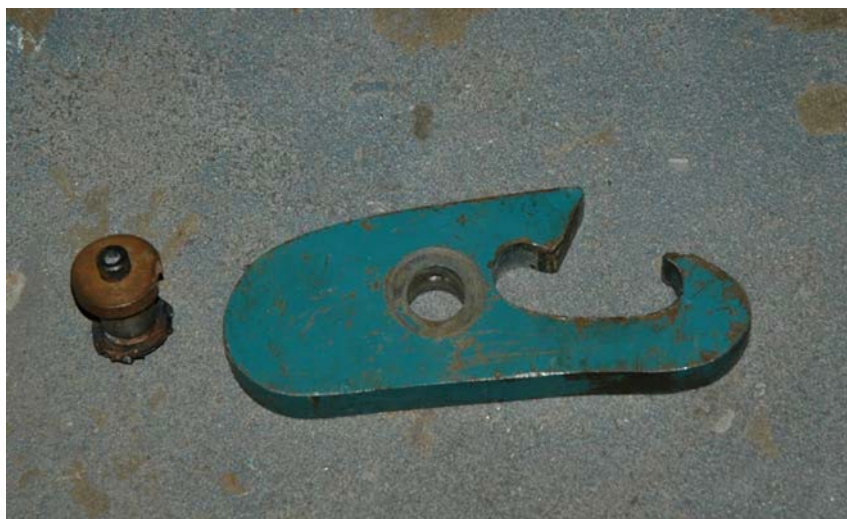
Figure 3: Retaining Latch and Pin (Broken)