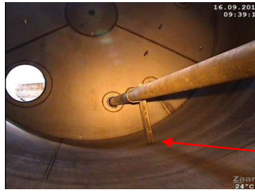
Top View 2