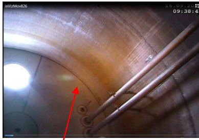
Top View 1